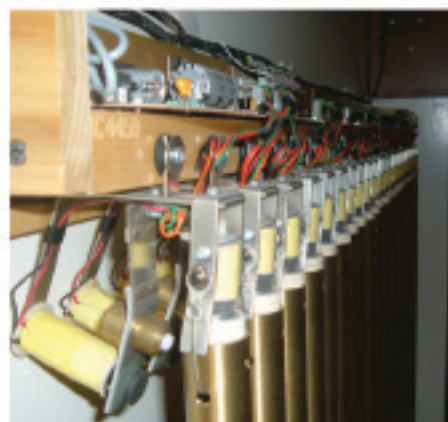
EXCLUSIVE MAGNETIC REPULSION STRIKER ACTION

LIMITED WARRANTY: All materials and workmanship are warranted for 10 years from date of purchase. See conditions of sale for specific conditions of warranty.